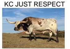
KC JUST RESPECT