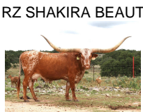
RZ SHAKIRA BEAUTY