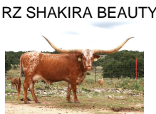
RZ SHAKIRA BEAUTY