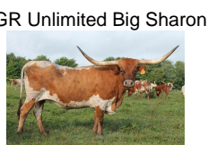
GR Unlimited Big Sharon