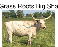
Grass Roots Big Sharon