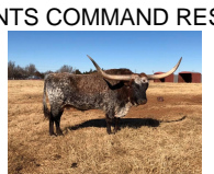
HUNTS COMMAND RESPECT