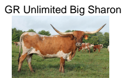
GR Unlimited Big Sharon