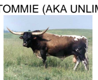
VJ TOMMIE (AKA UNLIMITED)